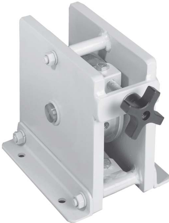
MECHANICAL TENSION BRAKE WITH BUSHINGS